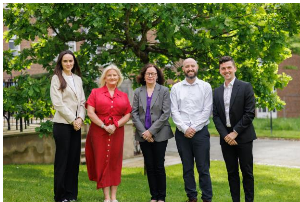
1 - The CHOICE team at Queens University Belfast